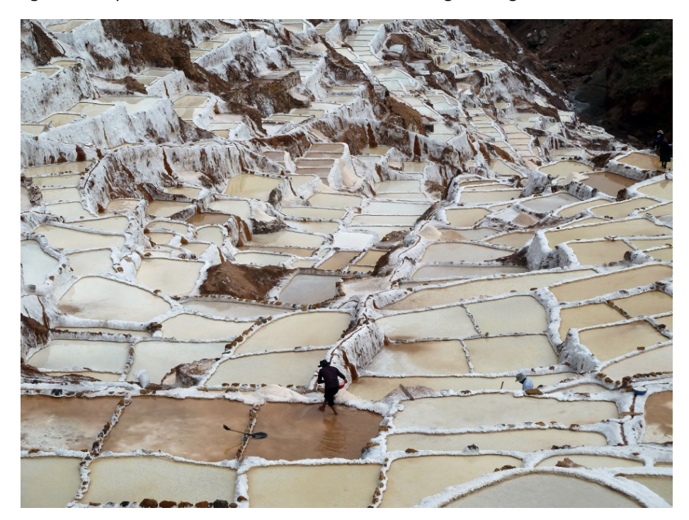
Salinas de Maras

Today is a Full and exciting day!! After breakfast we will have a full day excursion to the "Sacred Valley of the Incas". We'll have many surprises, including seeing the Incan agricultural center Moray and an easy hike through the Salt mines Salinas de Maras. After having lunch (included) in a local countryside restaurant, we will visit the Inca Fortress and Citadel of Ollantaytambo, built to guard the entrance to this part of the Valley. Afternoon train to Aguas Calientes, which winds down a narrow gorge. Overnight in this charming lush Outpost town" at hotel Tierra Viva . Overnight in Aguas Calientes. Free for dinner