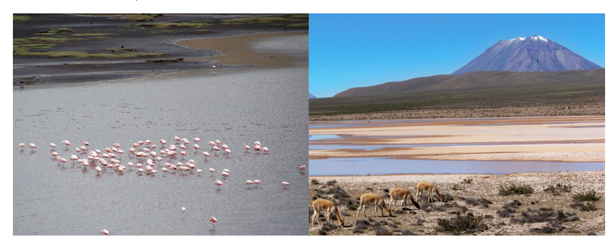
DAY 4: AREQUIPA / COLCA CANYON

We'll have a full day visit to the Salinas and Agua Blanca reserve. April is the tail end of the rainy season and with luck, we'll still see many flamingos). During the rainy season, this reserve is home to thousands of flamingos (3 species). Besides flamingos, there is a large variety of birds and other animal life, especially wild Vicuñas. Misti and other volcanoes tower above this pristine and tranquil reserve. Box Lunch is included. Remainder of the day free to explore Arequipa on your own. Overnight in Arequipa at Posada del Monasterio). Free for dinner