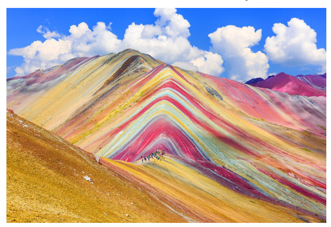
VINICUNCA- Rainbow Mountains

DAY 11: CUSCO / TOUR TO VINICUNCA (optional- if not explore Cusco on your own- lunch Not included). Very early (5am), we are going to leave Cusco by car, the estimated travel time is 3 hours, during which we will pass through traditional villages and see some amazing views of the Andes. We will begin the hike from Chillca, at 3,700 m/12,139 ft elevation. From here, it will be @3 hour, uphill hike to reach the famous Rainbow Mountain. Along the way, you will enjoy amazing views of the Andes, glacial peaks, red mountains, rocky hills and we'll see llamas and alpacas grazing along the valley. Once we arrive at the top of Rainbow Mountain, you will have enough time to absorb the majesty of these mountains that surround this area. You will also see amazing views of the valleys and Ausangate Glacier Peak in front of you. After soaking in the views, we will begin our descent with a 2 hour, downhill hike. Return to Cusco. Breakfast, lunch & Farewell Dinner included. Celebration in Cusco. Overnight in Cusco.